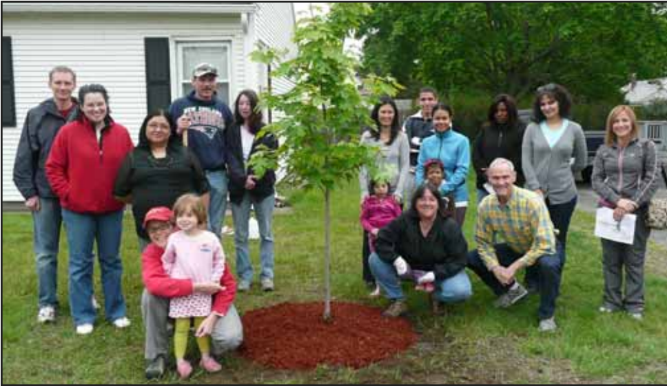
Home owners pose in front of a newly planted red maple tree.