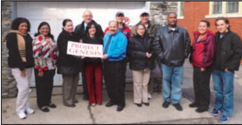
January 2012 Class