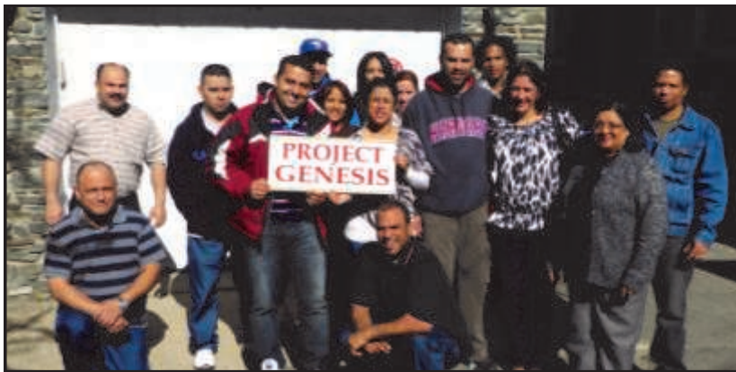
April 2012 Class